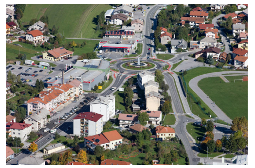
Aerial view of Pivka