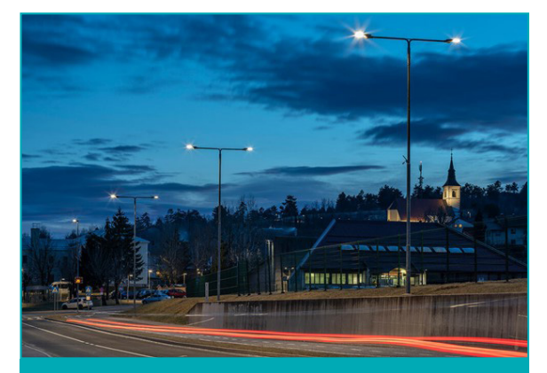
LED street lighting in Pivka

1. Preparation and Mobilisation of Financing for Sustainable Energy Investments in Primorska Region Municipalities (PM4PM)