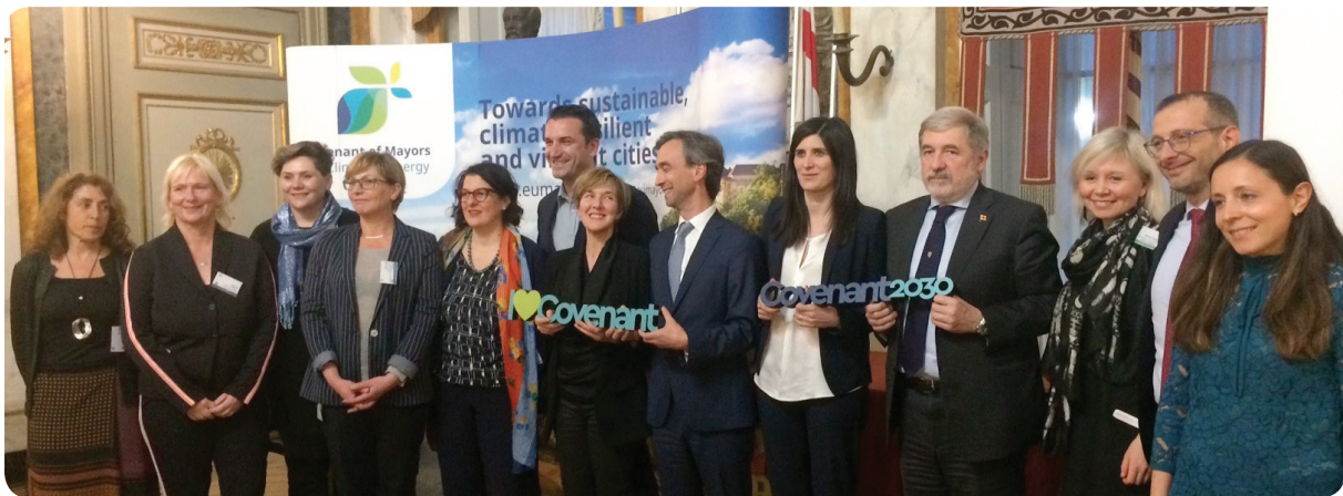
12 cities commit to the 2030 Covenant of Mayors targets in Genoa, Italy