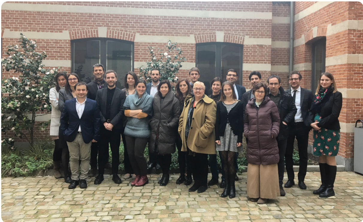
In-person consultation with city practitioners, March 2019, Brussels

The online reporting platform of the Covenant of Mayors - MyCovenant - is already available to signatories in its new version. Updated reporting guidelines and online tutorials will follow soon.