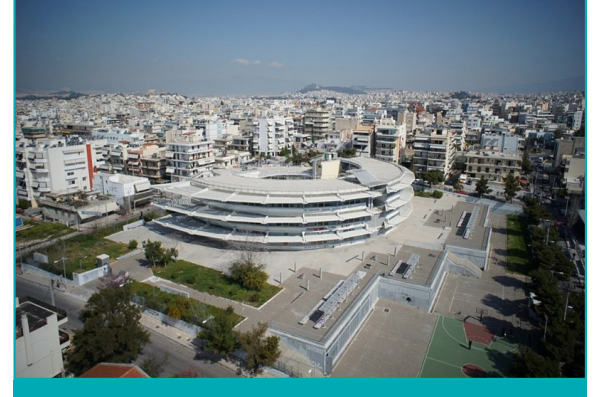
Building retrofit in Agios Dimitrios.